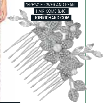
"FREYA" FLOWER AND PEARL HAIR COMB (£40) JONRICHARD.COM