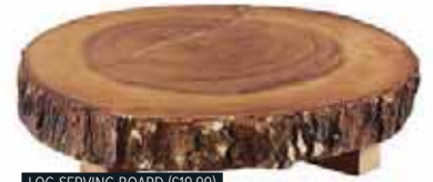
LOG SERVING BOARD (£19.99) TKMAXX.COM

Rustic log slices contrast beautifully with a touch of glitter in this scheme