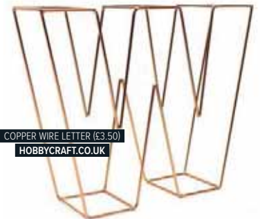
COPPER WIRE LETTER (£3.50) HOBBYCRAFT.CO.UK