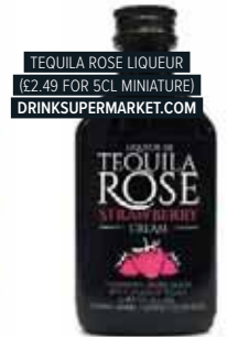
TEQUILA ROSE LIQUEUR (£2.49 FOR 5CL MINIATURE) DRINKSUPERMARKET.COM